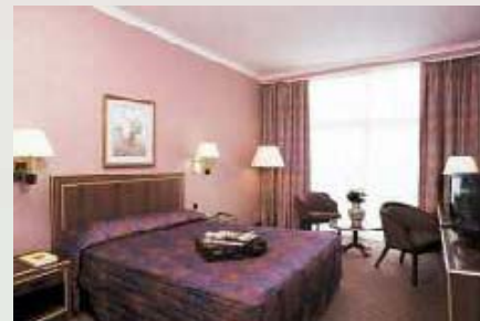
Some of the nicely furnished rooms in Ugandan hotels